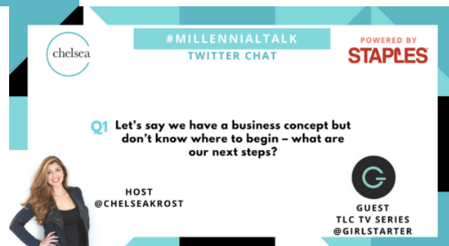
Example of question graphic