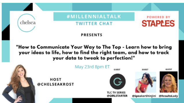
Example of custom promo banner, base off brand specifications